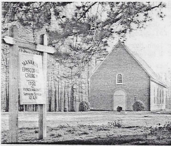
MANAKIN EPISCOPAL CHURCH Powhatan County, Virginia Founded in 1700 by the French Huguenots